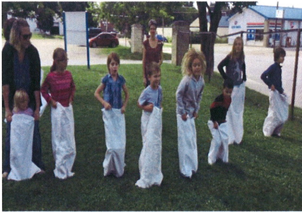
Anne of Green Gables picnic (above)