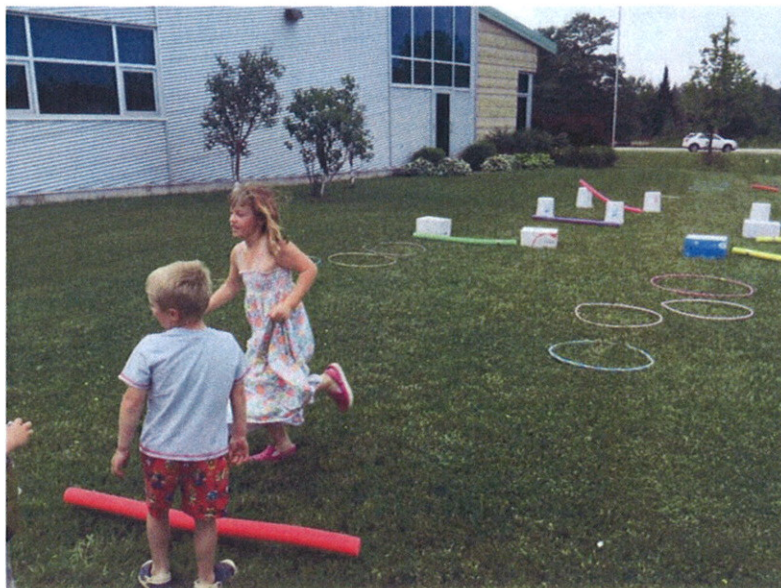
Super Hero boot camp